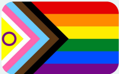
The Pride Progress flag, 1st July 2023