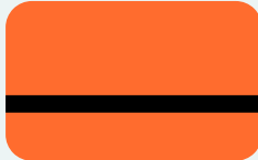
The Refugee Nation flag, 20th June 2023