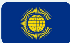
The Commonwealth flag, 11th March 2024