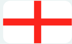
St George's Cross, 23rd April 2023