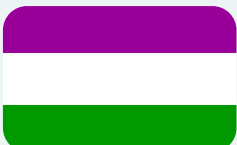
The Suffrage flag, 8th March 2024