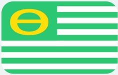
The Earth Day & Ecology flag, 22nd April 2023

The installation of the new flagpole at The Millennium Garden gave us the flexibility to fly a whole range of flags on behalf of the Town Council and local organisations. Between April 2023 and March 2024 we flew: