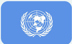
The United Nations flag, 24th October 2023