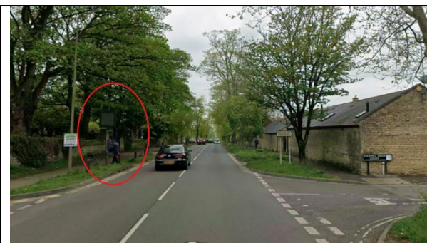
Fig 1: Inbound VAS on London Road – Proposal to replace with new SID on existing post

Proposed Scheme: OCC will remove both of the London Road VAS units, replace the inbound one with a new SID on the existing post and additionally install a new SID on lamp column 19 on Burford Road. The new isolator required for this will be fitted by OCC's street lighting contractor at no cost to the town council.