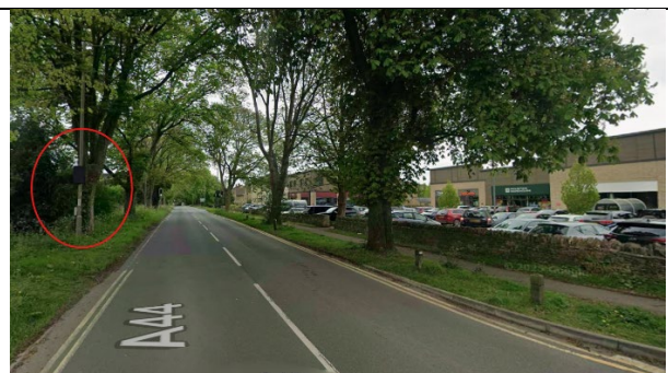
Fig 2: Current outbound VAS on London Road – proposal to remove and relocate to Burford Road