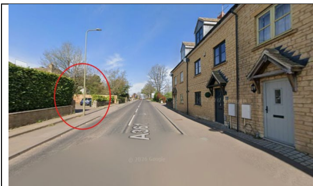
Fig 3: Lamppost 19 on Burford Road – proposal to relocate outbound VAS from London Road to this location